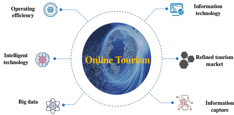
Fig.2 Characteristics of Online Tourism